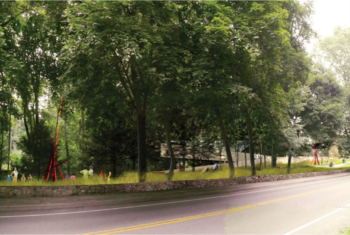
imagine MORE ways that you can enjoy the KMA