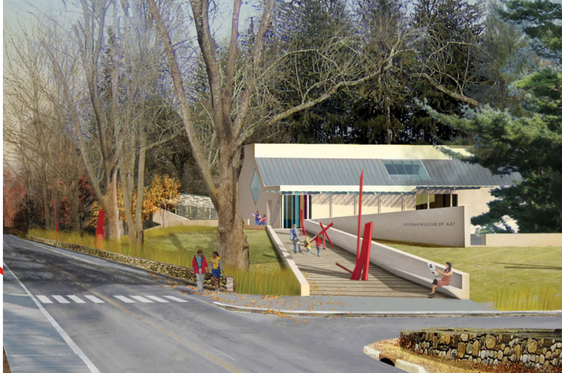
imagine a broad welcoming walkway with views of sculpture throughout the landscape