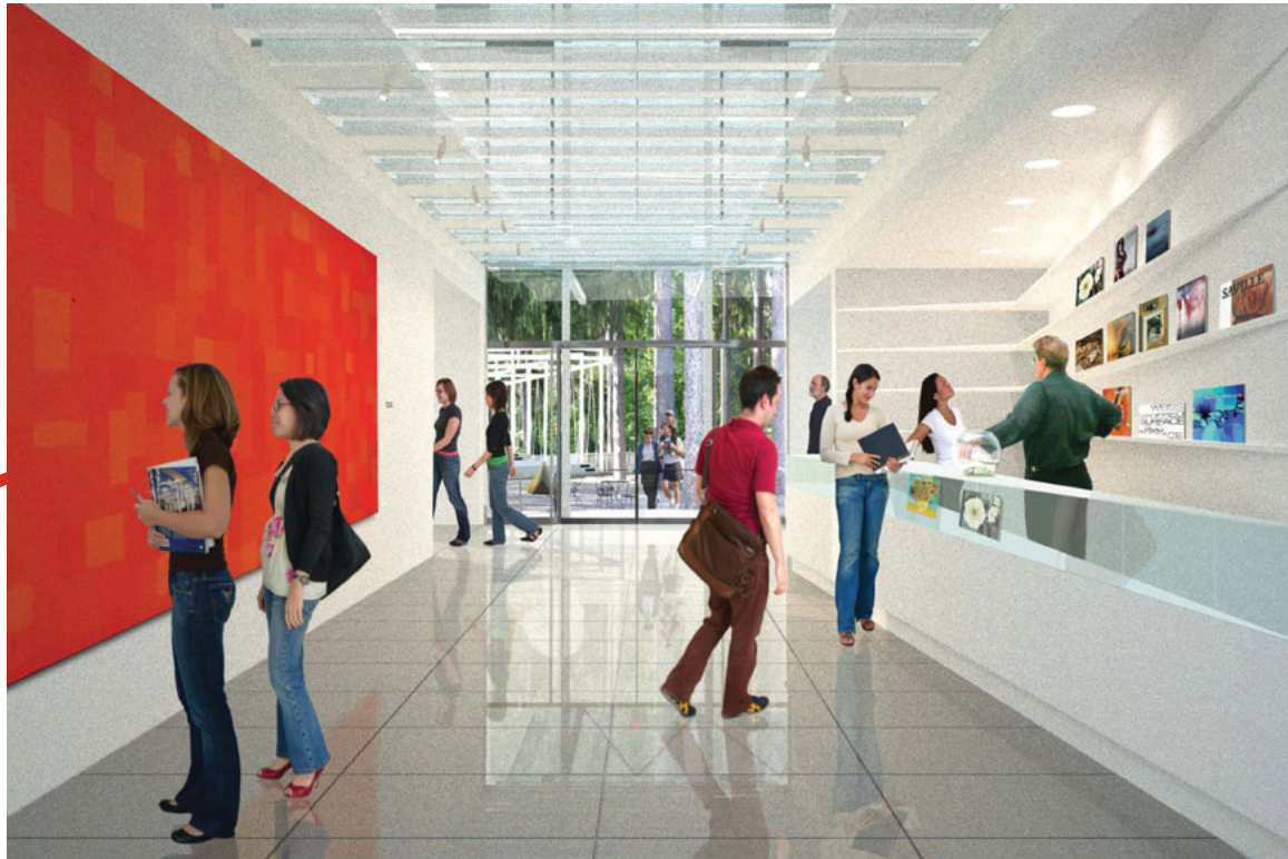
imagine a dazzling atrium with MORE room for socializing and shopping