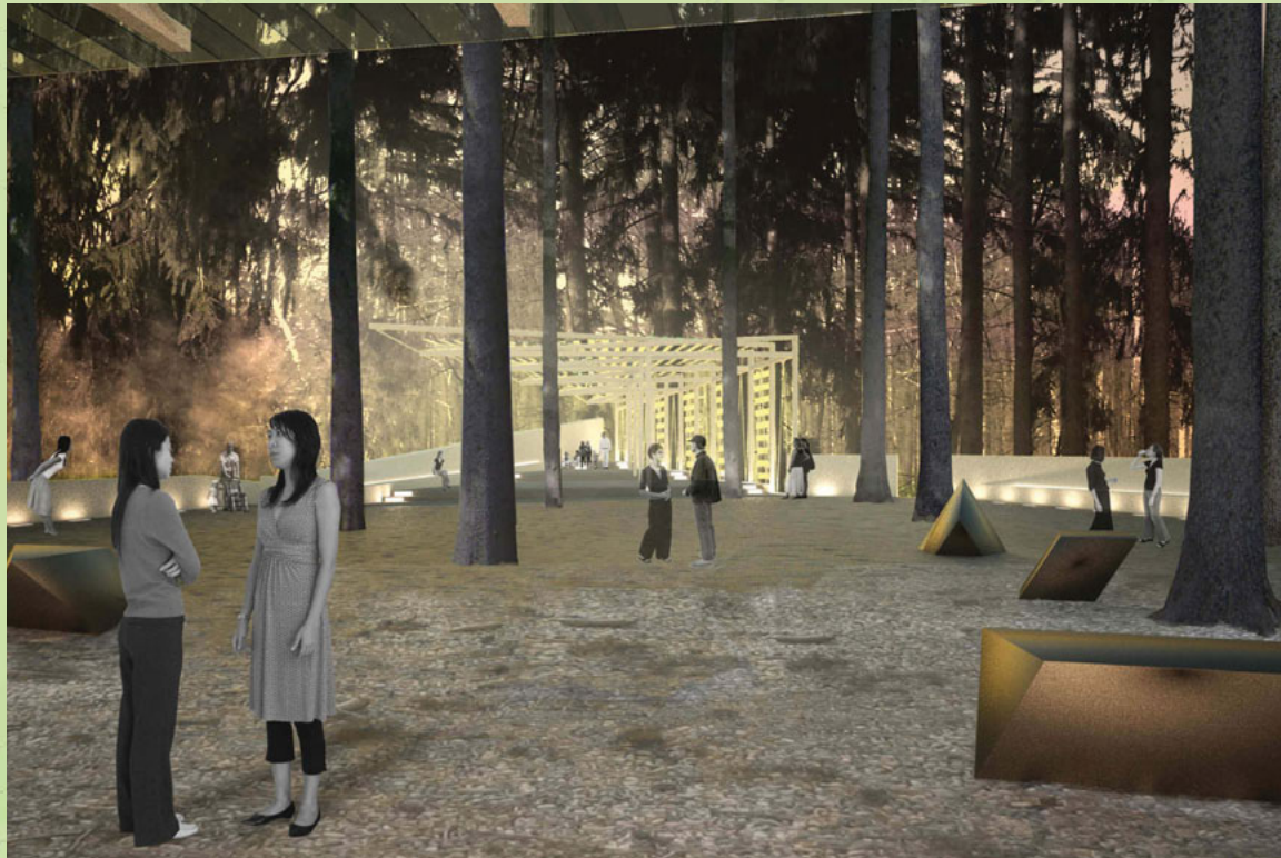
imagine a glass pavilion for readings, music, and MORE